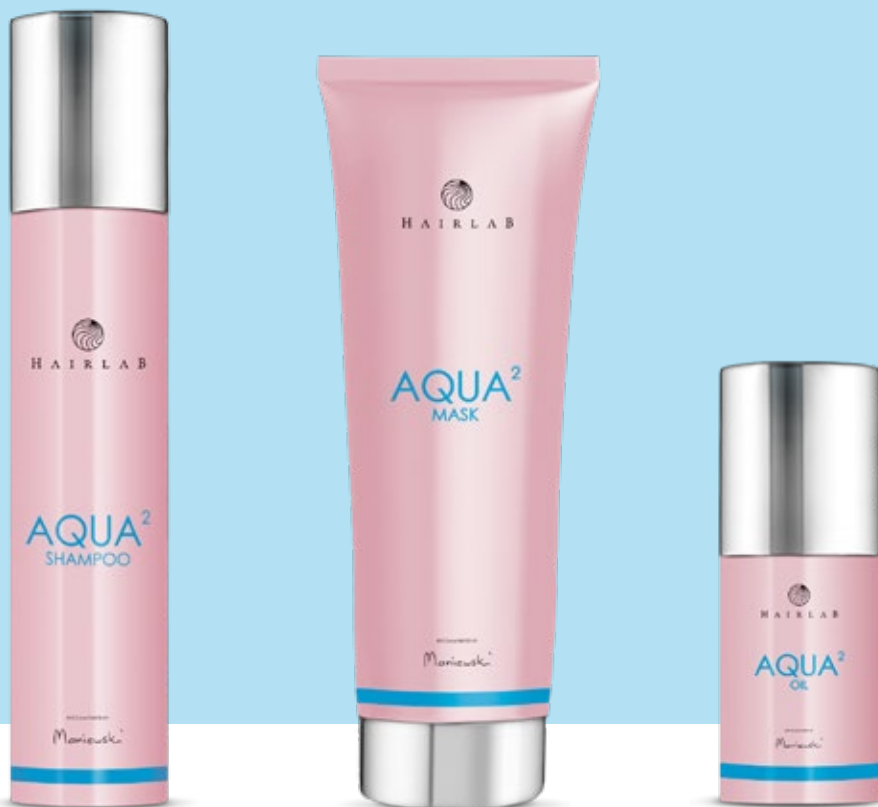
AQUA² SHAMPOO | 250 ml